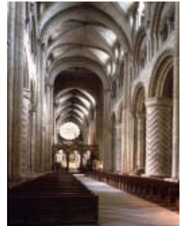
Views of the naves